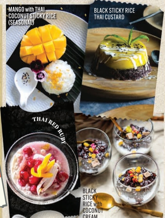
MANGO with THAI COCONUT STICKY RICE (SEASONAL)