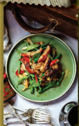
GRA PRAO ROAST DUCK ..... $23.9 Stir fried of the full flavour five spices roast duck, green beans, onions, chilli, garlic & Thai basil.