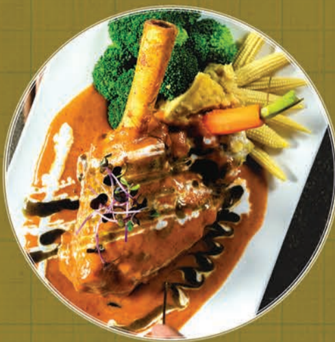
MASSAMAN LAMB SHANK ..... $28.9 A delicious & tender 14 hours slow cooked lamb shank w/ massaman curry, served w/ lentil puree and vegetables.