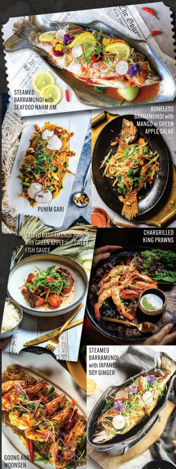
STEAMED BARRAMUNDI with SEAFOOD NAHM JIM