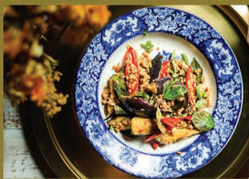
CHICKEN MINCE w/ EGGPLANT ..... $18.9 A perfect stir fry of minced chicken, Thai basil, eggplant, fresh long chilli in chilli-garlic & chilli-basil sauce.