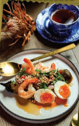
GRILLED EGGPLANT SALAD ..... $24.9 Topped w/ minced chicken, prawns, fine herbs & chilli. Served w/ a soft boiled egg.