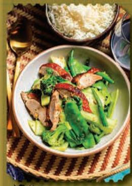
GREENS GARDEN w/ ROAST DUCK $23.9 Stir fried mixed vegetables w/ oyster sauce, fried garlic & tender roast duck.